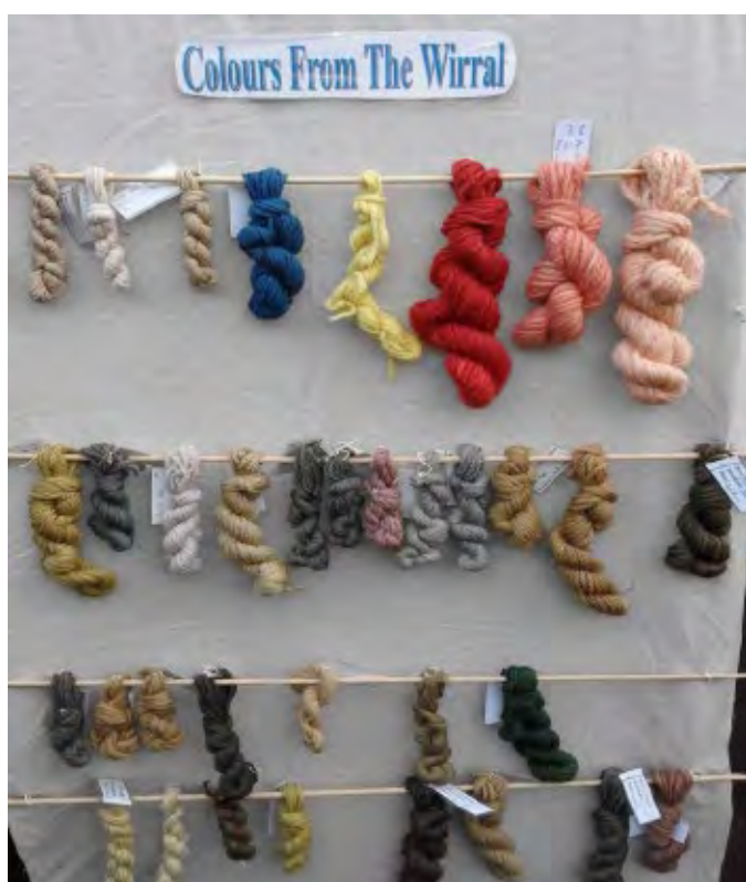
Results from stage 1